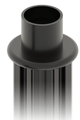
Post Top Tenon