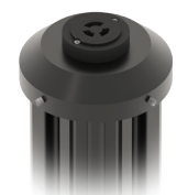
7-Pin Socket available with Photocell and Shorting Cap options