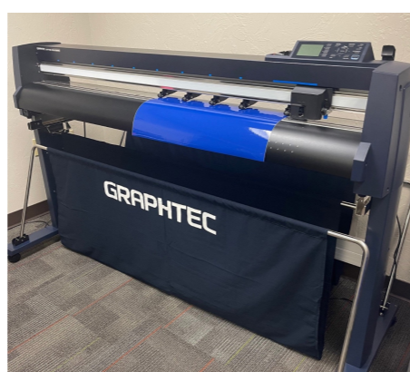
The Graphtec cutter works with adhesive backed vinyl and electrocut film, as well as engineering grade and diamond grade reflective vinyl.

Pelco's new capabilities of sign making allow us to manufacture various signs meeting Federal MUTCD specifications. Now with in-house printing, cutting, and laminating, we can reduce cost, reduce lead time, and provide a superior extended-life product.