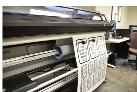
The HP Latex printer has the capability of printing full color graphic images.