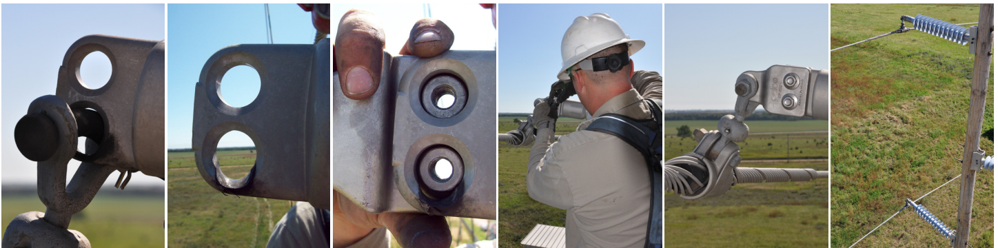
Visual evidence of steel-against- aluminum damage